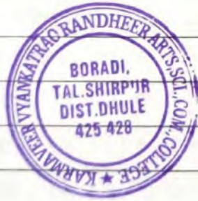
PRINCIPAL KARMAVEER VYANKATRAO RANDHEER ARTS, SCIENCE, COMMERCE COLLEGE BORADI, TAL. SHIRPUR, DIST. DHULE

The meeting was closed with the permission of the chairman.